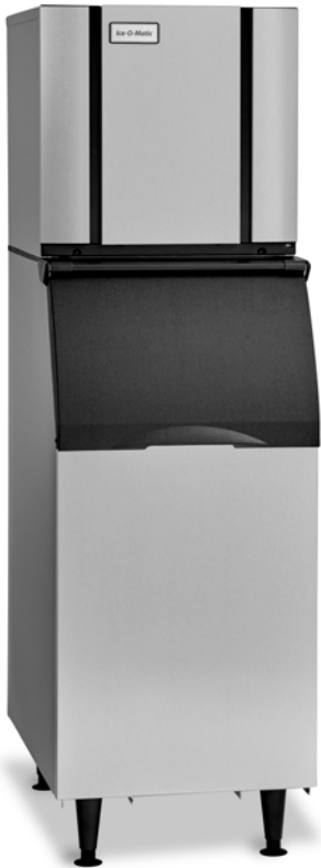
CIMO325 ON B42