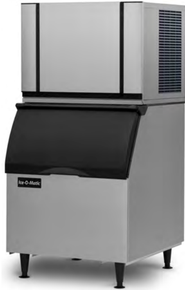
CIMO435 ON B40