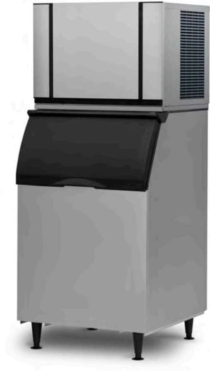
CIMO635 ON CIB230