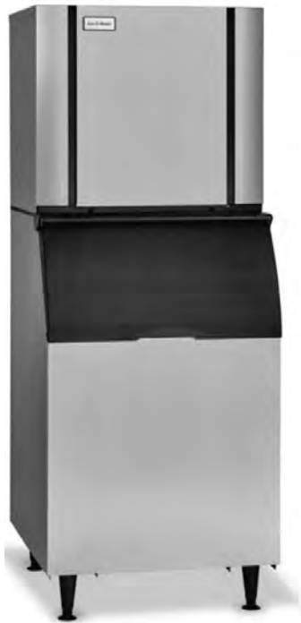
CIMo835GA ON CIB230