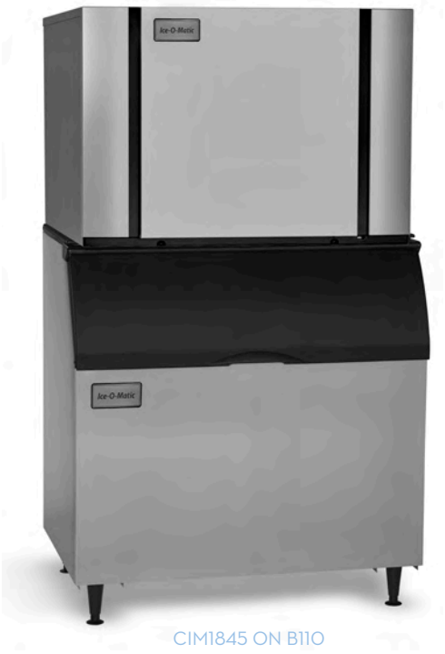
CIM1845 ON B110